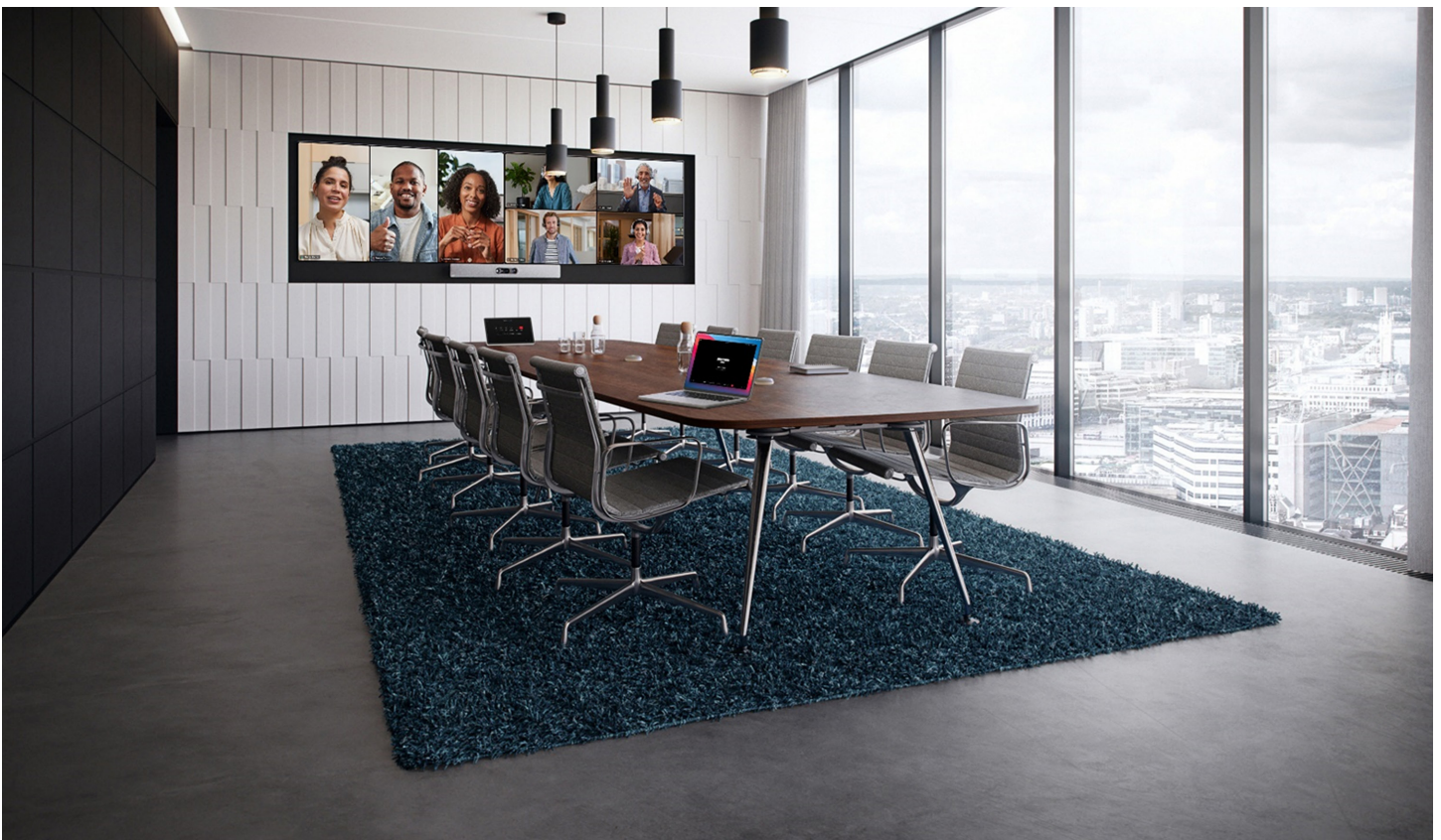
Figure 1. The Cisco Room Kit EQ in a conference room with the Quad Camera, the table-stand Room Navigator, and the Cisco Table Microphone Pro.

The Room Kit EQ provides optionality and extensibility with a highly modular setup to easily add touch controllers, cameras, speakers, microphones, and other room peripherals – easing the configuration and scaling of complex, multi-component audiovisual environments. This solution is rich in functionality and experience yet easy to deploy, maintain, and scale to your workspaces – and comes with unified cloud device management and workspace analytics in Control Hub.