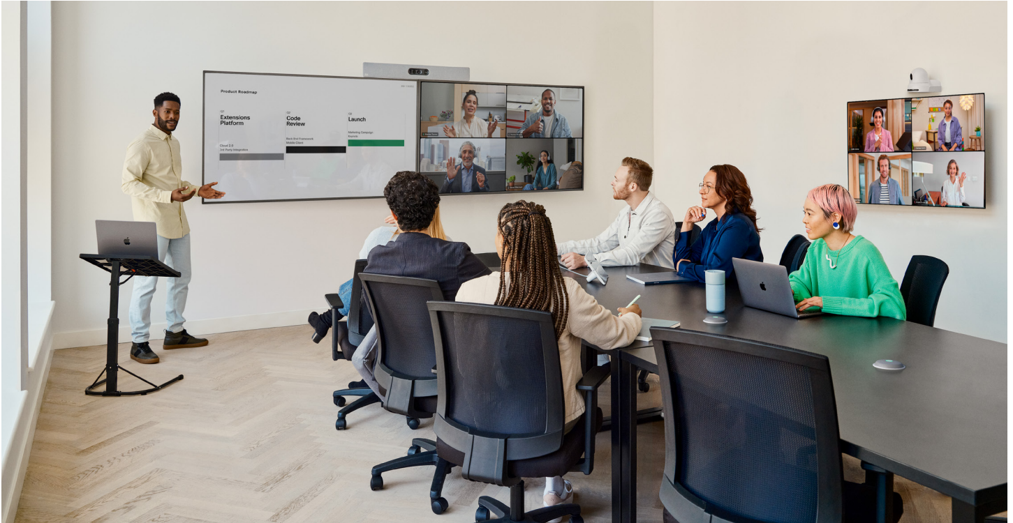
Figure 3. Cisco Room Kit EQ in a large training room featuring the Quad Camera, the PTZ 4K Camera, the Room Navigator tabletop touch controller, and Cisco Table Microphone Pro devices.